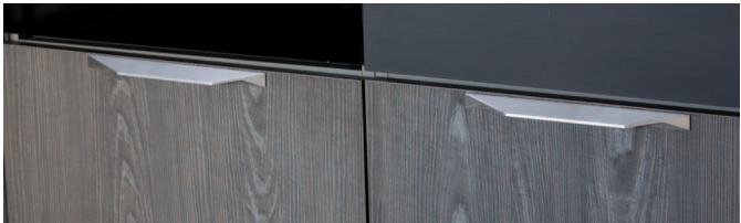
The CUTT pull handle can be positioned at the top of a drawer or placed in the middle