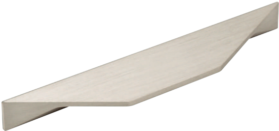
CUTT pull handle