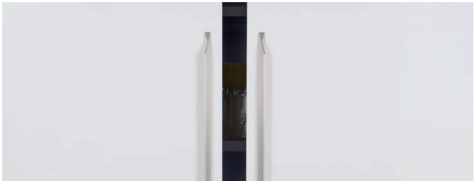
Additionally looks great vertically on slab bedroom doors